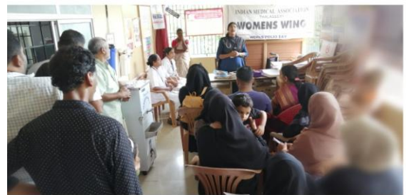
ലോക പോളിയോ ദിനാചരണത്തോടു കൂടെ സൗഖ്യസമൃദ്ധ നടനബോധവൽക്കരണ ക്ലാസ്സ്